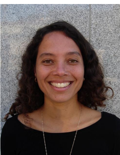
Fenna Sillé School of Public Health